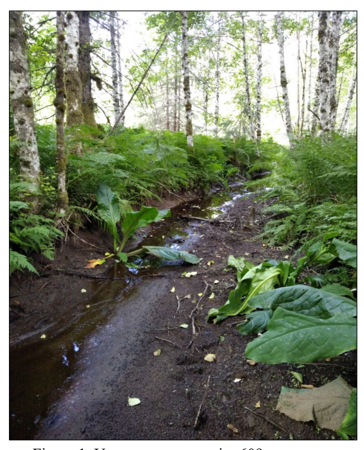
Figure 1. Upstream at waypoint 609.